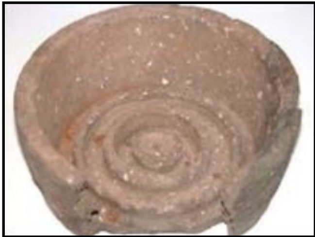
Figure 1 - Roman Cheese Press, 3rd C. BC

BBC News http://news.bbc.co.uk/1/hi/england/cambridgeshire/4908180.stm