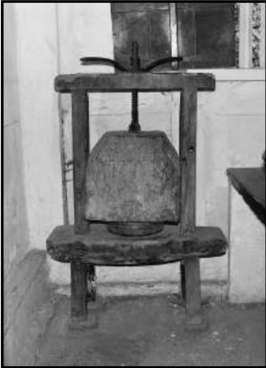
Figure 3 - Cheese-press, Merionethshire

http://www.gtj.org.uk/en/small/item/GTJ31093/