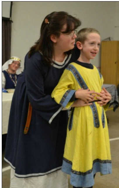
A pint size member of Terra Pomaria entering the Bardic Championship at Briaroak Birl.