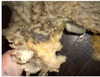
Skirting/removing unusable wool