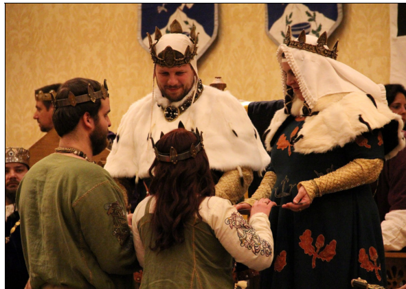
An Tir's Crown Prince and Princess swearing the Oath of Sovereignty.