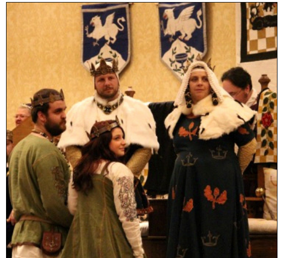
An Tir's King and Queen and Their Heirs, during the coronation ceremony at 12th Night.