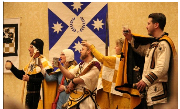
The Champions of An Tir toasting the next King and

Exchequer: Statement balance as of 12/31/13 was $9613.00. Our balance as of 1/20/14 is $9530.90, $574.57 of which is Ithra's. We also have $1000 in