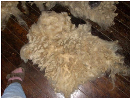
Half of Fleece laid out and ready to skirt

The first step is to lay the fleece out for "skirting", wherein the belly, crotch area, lower leg and neck wool is removed and discarded, leaving the "prime", or best useable fleece for further cleaning. ( Paula Simmons, "Spinning and Weaving with Wool", pgs 10-12 ) ( Crowfoot/Pritchard/Staniland "Clothing and Textiles 1150-1450" page 17 ) ( Buchanan, "A Weaver's Garden", pg 124 )