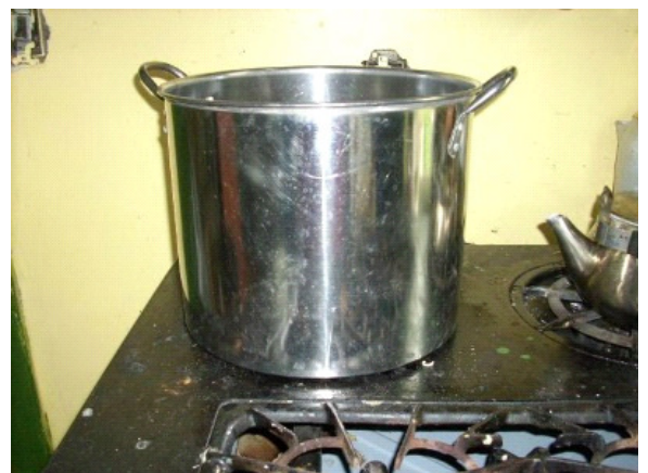
Pot awaiting its fate