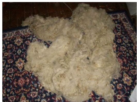
Fleece pulled apart and laid out to dry.

I periodically turned the fleece to ensure thorough drying. It was completely dry within 24 hours and ready for the next step in the process, which would be combing or carding in preparation for spinning.