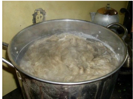
Fleece soaking in simmering rinse water. Already it is looking cleaner and whiter.

I let the fleece soak in its simmering rinse bath, turning it periodically with my stick and checking its progress until my “sample pieces” felt free of scour, about 30 minutes.. I then emptied the pot and contents into the laundry sink and allowed it to drain once again. After it had drained of most of its liquid, I gently squeezed the rest out and laid the fleece out to dry in a warm spot in my living room.