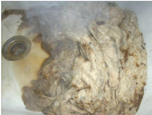
Fleece draining in the laundry sink after scour. It is actually a lot cleaner than it looks. Remaining “particulate” or vegetable matter will be eliminated during carding or combing.

I then emptied the contents of the pot (fleece and scour) gently into my laundry sink, where it was allowed to drain until no more liquid ran from it. I rinsed the pot and filled it with clean water, heated it to simmer, and gently placed the fleece back into the pot with the aid of my “helper stick”.