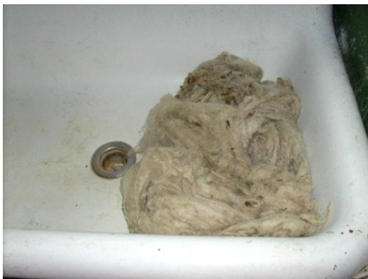
Fleece draining in the laundry sink. Much cleaner.

I let the fleece soak in its simmering rinse bath, turning it periodically with my stick and checking its progress until my “sample pieces” felt free of scour, about 30 minutes.. I then emptied the pot and contents into the laundry sink and allowed it to drain once again. After it had drained of most of its liquid, I gently squeezed the rest out and laid the fleece out to dry in a warm spot in my living room.