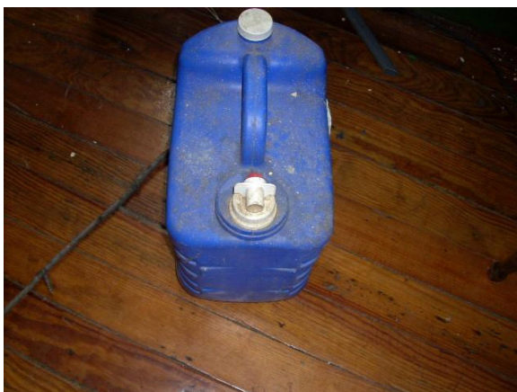
Urine getting stale and fermenting. It sat around for a while – look at all the dust on the jug!

The next step is the actual washing. For this I chose male human urine for this process (donated by my significant other), collected over a period of several weeks in several big plastic jugs, and then left to become stale and ferment over a period of several months. The urine breaks down into ammonia and uric acid, both of which are extremely efficient at dissolving and emulsifying waxy grease such as lanolin, and dirt.