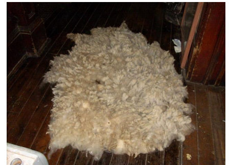
Half of Fleece after skirting, ready to wash

The next step is the actual washing. For this I chose male human urine for this process (donated by my significant other), collected over a period of several weeks in several big plastic jugs, and then left to become stale and ferment over a period of several months. The urine breaks down into ammonia and uric acid, both of which are extremely efficient at dissolving and emulsifying waxy grease such as lanolin, and dirt.