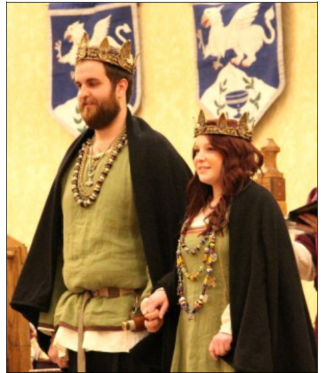
Our new King and Queen of An Tir

Total number through gate was 67. Gate intake was $950. Expenses were $470. After sending out the NMS check, the profit of $239.07. I received a thank you note from one of the attendees who said the best thing about the event was the people.