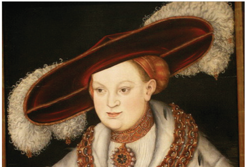
Magdalena of Saxony by Lucas Cranach the Elder