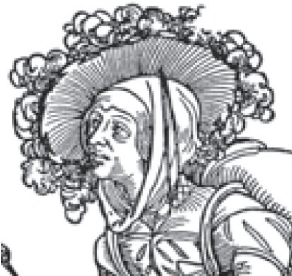
Musketeer and Wife by Max Geisberg

16th century Germans wore many hats, one of which we call a Tellerbarett (platter hat). You can see versions of this large, round, flat hat in many paintings and woodcuts of the era. I could find no reference to surviving hats from this era, so I have only images to go by. It seems clear to me that the hats were constructed in different ways—each of the three images below shows a slightly different construction—but they all share the large, round shape and feathers are common.