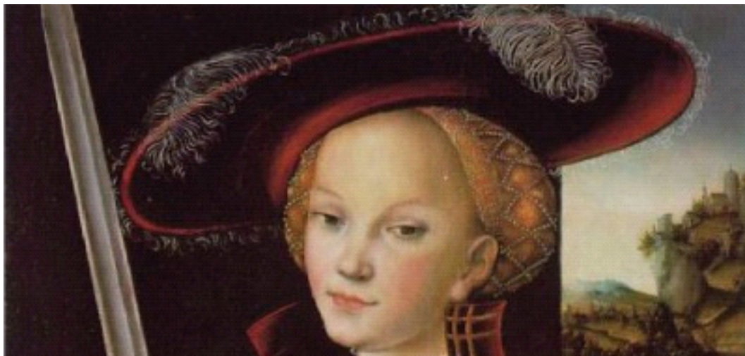
Judith Victorious by Lucas Cranach the Elder