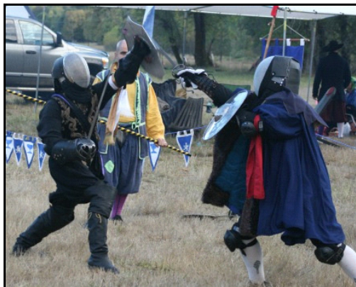
Fighters in the Summits' first Cut and Thrust Championship Tournament.

I want to note, this bid is a pessimistic forecast for the event. The attendance numbers listed here are lower than all but one of the three recent years that I have access to. (2010, 2011, 2013) It is my hope that with early planning and