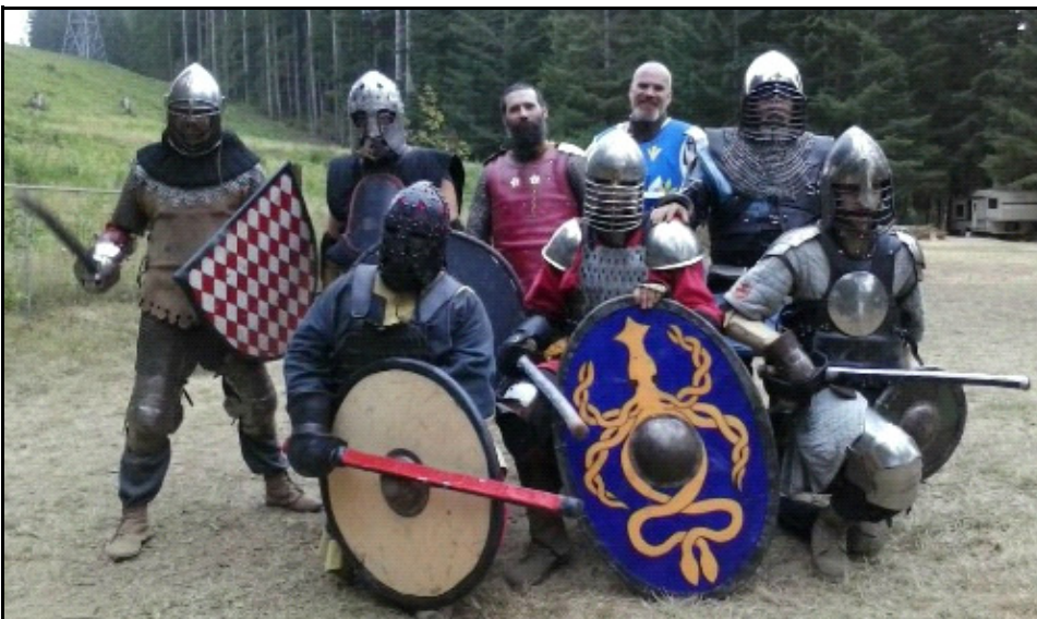
The first fighters to rally to the war banners of Terra Pomaria and Adiantum. Prelude to War 2013.