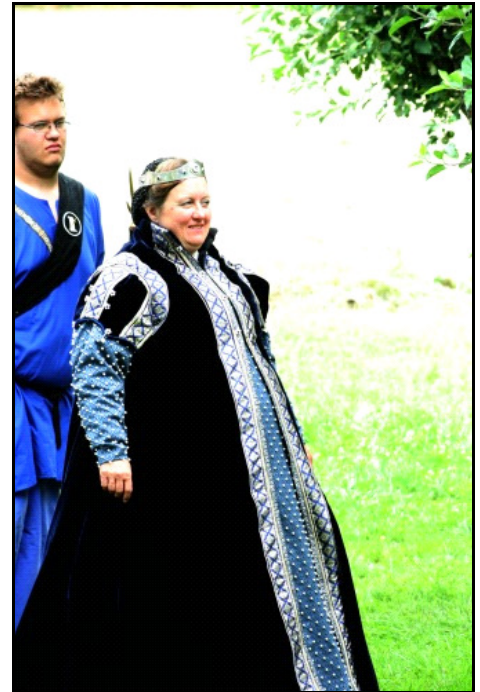
Soon-to-be Princess Ekatarina Tatiana Aleksandrovna processes in to court at June Investiture 2013.