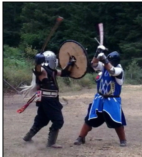
The Barons of Adiantum and Terra Pomaria face off at Prelude to War.