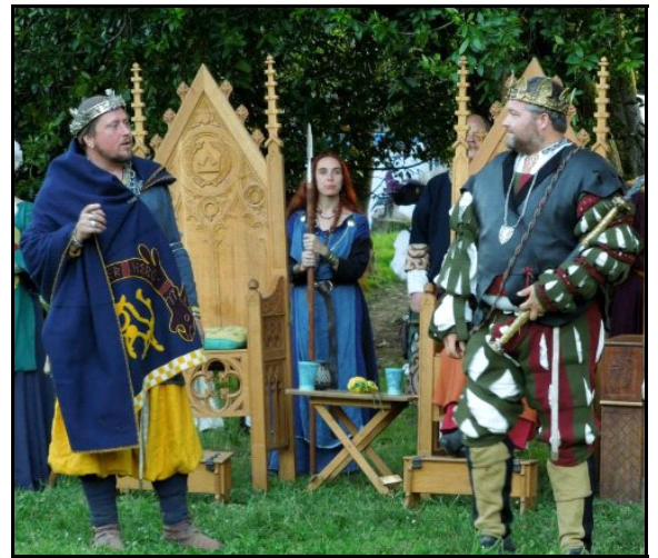
The Kings of the West and An Tir at An Tir/West War 2013.

moved before sending. Discussion ensued regarding the pros and cons, and they only con mentioned was not being able to tell how many people are reading it. It was suggested that we put a counter on the web page in order to keep idea of how many people are reading.