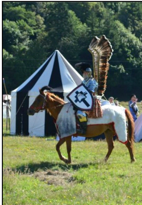
A call to WAR! At An Tir/West War 2013.