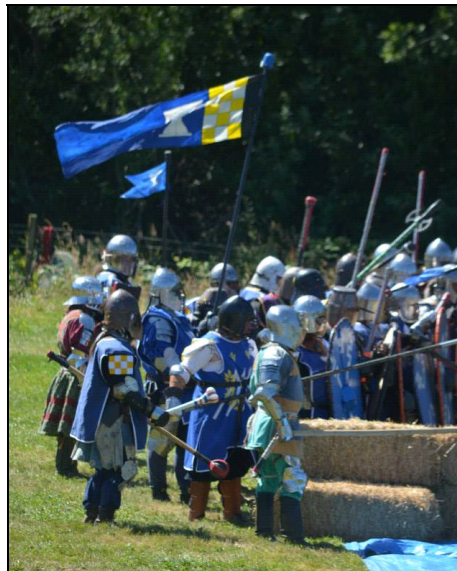
Summits troops prepare for battle at An Tir/West War 2013.

Scribe: Held monthly meeting at MBC Gaming, 5008 Commercial St SE, Salem, OR. We had 6 attendees. We are holding the next scribal night this wednesday, July 17th. I have permission to hold this office in addition to the principality webminister, but I am well past my 2 year time term, so if you are interested in the office, please contact me.