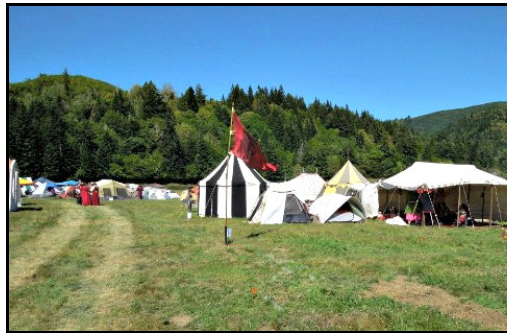
The weather at An Tir West War was beautiful this year.

$10,155.07 is the amount left after uncashed checks. We still have ithra's funds of $574.57 which leaves us with $9,580.50. Saturday we held our financial committee meeting. We added the regalia fund to the financial policy. We are sending $150 to Coeur du Val as a thank you for lending us their lands for Long & Short for the past two years. This is a little over 10% of the profit from both years.