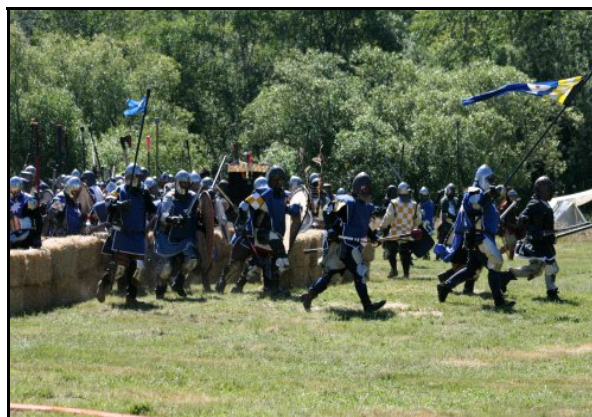
“Forward to Battle!” at An Tir/West War 2013.