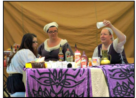
The coffee fundraiser was a success, raising $600 for the Summits General Fund.