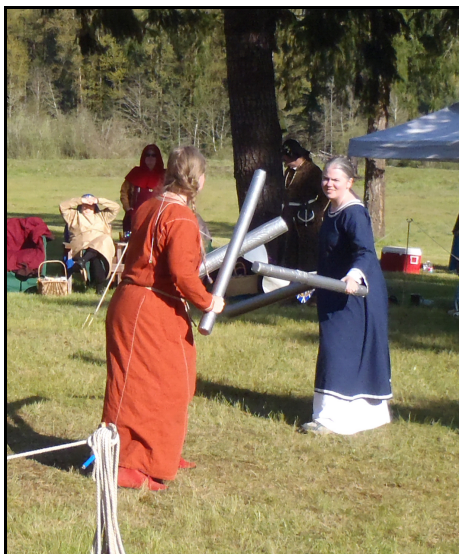
Two combatants face off in Bar Gemels 2011's Bar Wench Smack Down