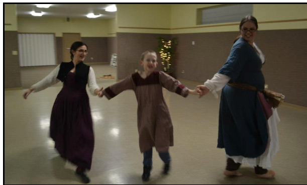
March Ceilidh was an enjoyable if exhausting evening, filled with dancing and games.

Scribe: I have temporarily suspended monthly meetings as I am still looking for a suitable site. If anyone has leads let me know. I have a $20 per